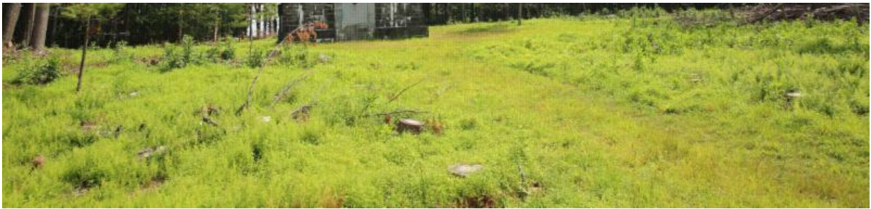
Above: The Waldo Smith Monument now cleared from encroaching trees.

Visitors to the Ashokan Day Use Area may have noticed some changes. Late last year, DEP removed trees around the J. Waldo Smith Monument, giving many people their first glimpse of a tower that was once used to survey the reservoir construction. This past spring we installed new benches and interpretive signs. The new signs feature information about the reservoir, the history of its construction, recreational uses, and surrounding natural features. We will continue our work at the J. Waldo Smith site this fall when the eagle-nesting period is complete. We would like to thank all our recreational visitors for their patience as we continue to make improvements. Come out for a walk or a bike ride to check out the progress.