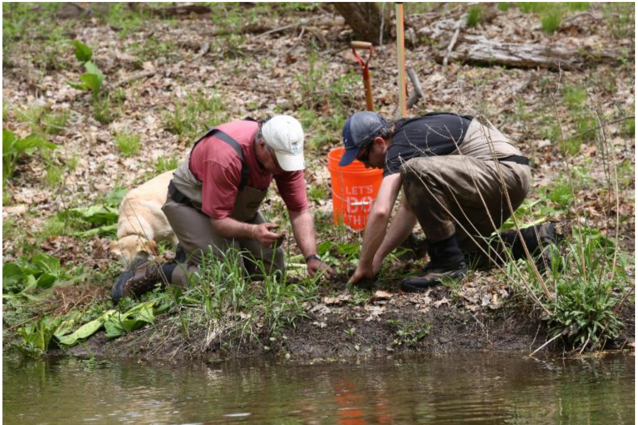
Above: Members from the Croton Chapter of Trout Unlimited plant trees along the Muscoot River.

The DEP Watershed Land Steward Program is into its second year. The current program is taking place at the Kensico and Pepacton reservoirs. The volunteer stewards assist in protecting the resources of the NYC Water Supply System by encouraging the responsible and sustainable use of its reservoirs and recreation lands. New this year, we're also partnering with the Croton Chapter of Trout Unlimited,