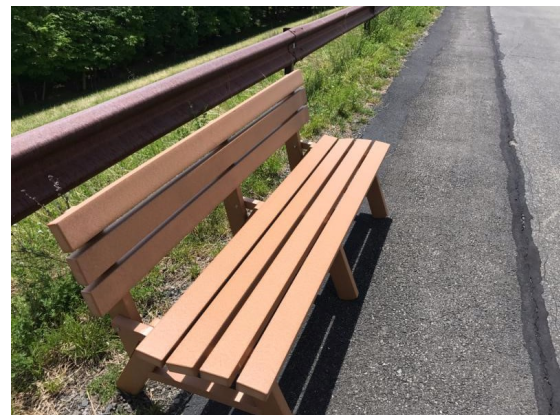
Above: New bench along the Ashokan walkway.