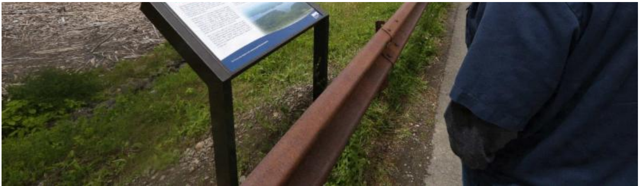
Above: Recreational walker at Ashokan viewing the wayside exhibit for the first time.